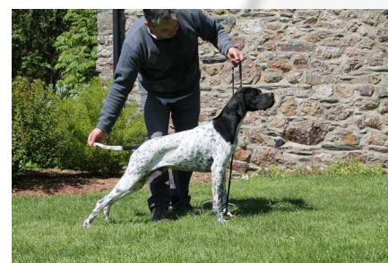
Icare des Légendes de Brocéliande à Jacky Lorant

The election of the best photo for the next Newsletter is open on our Facebook page : one picture per participant to be sent to tpeltey@yahoo.fr